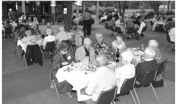
Nearly 140 retired faculty and staff enjoyed steaks grilled to order by retiree chefs at Steak Bake 2009.

Registration forms can now be downloaded at the Retiree Center Web site, http://retireecenter.ucdavis.edu .