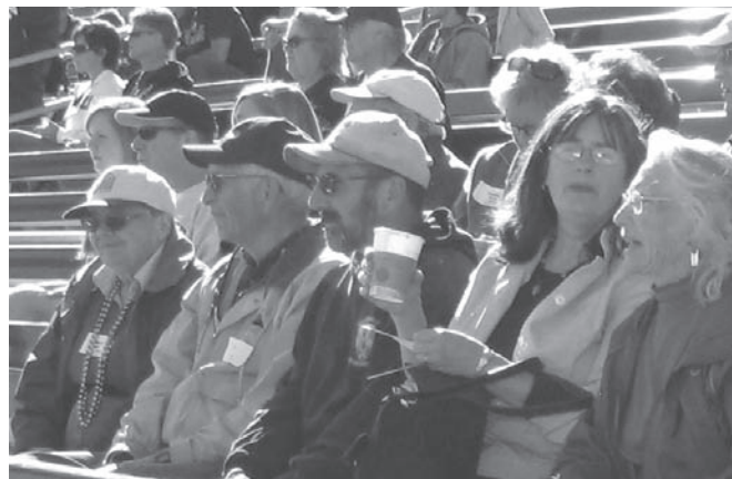
Retirees formed a cheering section in Aggie Stadium for the game against Cal Poly after their tailgate lunch in 2010.

Calling Aggie football fans! Join other UC Davis retirees to cheer on the team in the classic game between the UC Davis Aggies and the Sacramento State Hornets. Details of this event were still being finalized as Campus Connections went to press, so they will be sent via e-mail and will be available on the Retiree Center website. If you do not have e-mail or access to the Internet, call the Retiree Center for additional information.